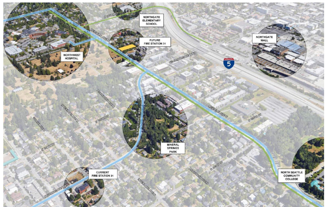
Figure 1: Neighborhood context

The urban design approach was described. The designers have worked on community centers and understand providing for interaction with the public. The approach to this facility is to provide a beacon without being a magnet because the station is busy and not always safe to be near when it is in use.