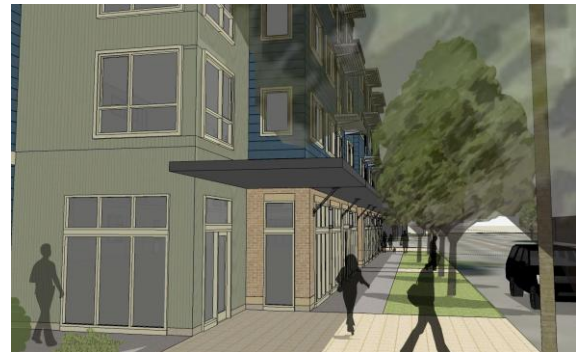
Northwest Corner of the Building; South from Rainier

There is a traffic island to the South with a bus stop. Since there are single-family homes blocking the route, it is assumed that Wolcott Avenue S will not be connected in the future.