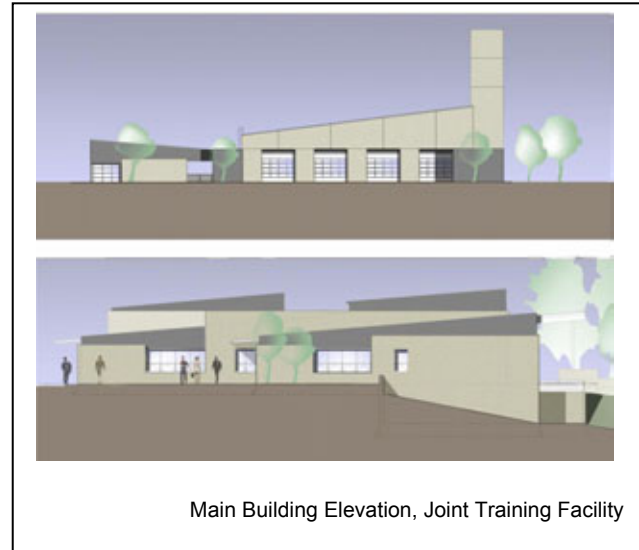
Main Building Elevation, Joint Training Facility

The building's interior layout now features a common skylit entry corridor with two access points from the north and south. The plan includes clear separation of public and private areas defined by the corridor with a Multipurpose Room, a Library/Resource Room, flexible and expandable classrooms ranging in size from 30-150 occupants with some "dirty" classrooms which will be fully washable, offices, a Work Hardening room for testing, storage and locker rooms. The Multipurpose Room and kitchen are located at the east end and will be available for after-hours use along with public restrooms. The building is smaller than before, but more flexible and designed to accommodate growth. Daylighting and natural ventilation have been well thought through to make this a truly functional building. Simple, elementary materials will be employed including steel framing, concrete block, wheatboard, lots of glazing and large roll-up doors.