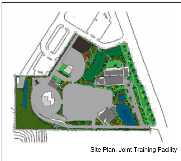
Site Plan, Joint Training Facility

The project is located at the far south end of Seattle, on the site of an old sand and gravel pit in a largely industrial area, with adjacent residential areas to the west and north, a park and ride lot to the north, low income housing to the south and a church to the east. Views along Meyers Way will remain heavily vegetated which will obscure views onto the site and similar buffering exists on the hill to help screen the site from adjacent residential areas. The slope provides expansive views north to Seattle from the surrounding hillside, but the site itself will be mostly obscured from view.