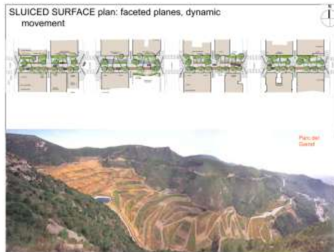
Figure 1: Sluiced Surface Plan