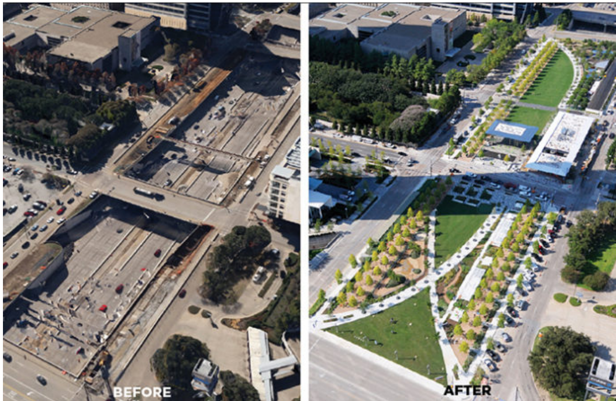
Klyde Warren Park - Dallas, TX

Seattle is a rapidly growing city. Reclaiming land in a central location could provide social, environmental, cultural, and economic benefits. Local lids include the Washington State Convention Center and Freeway Park, Seattle Municipal Tower, and Aubrey Davis Park in Mercer Island.