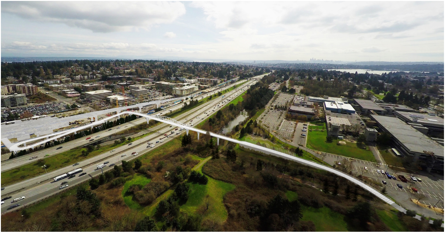
Aerial view of bridge design rendering, looking south.