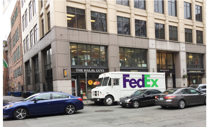
SDOT will be assessing commercial vehicle load zone locations in Pioneer Square.

Throughout 2019 and 2020, SDOT will install a monitoring system and conduct a complete assessment of the areaways to determine a long-term plan of action to repair necessary areas. In the meantime, our goal is to provide adjacent businesses and residents with accurate and timely information as we move forward to improve safety.