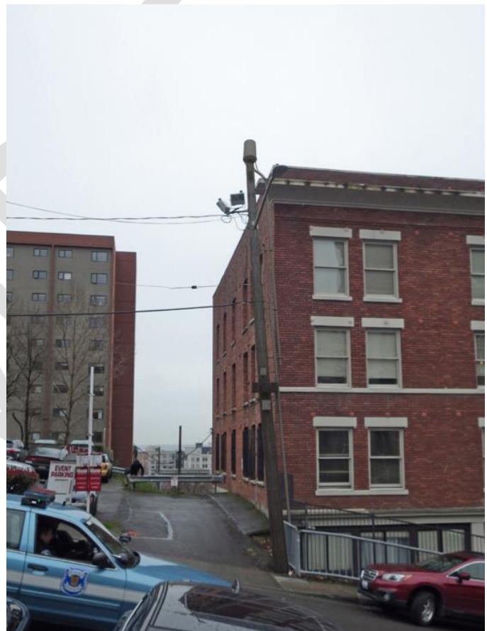
Photo simulation of proposed antenna installation and [new height of pole] utility pole along [insert cross street/area].