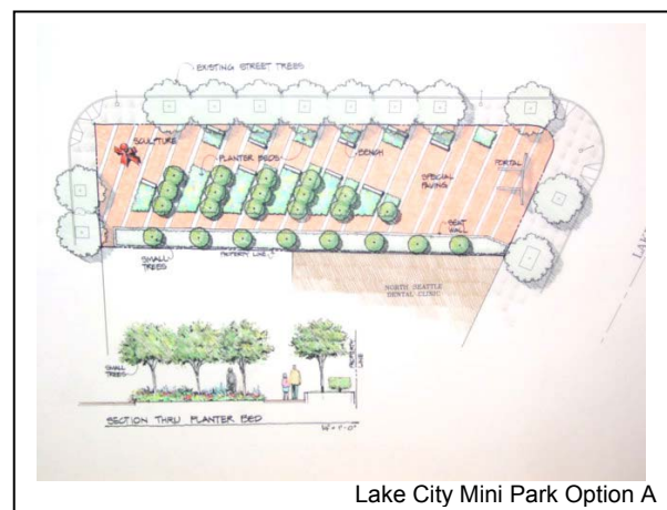
Lake City Mini Park Option A

The site is roughly 40ft wide by 150ft long. The area was originally a forest which was then used