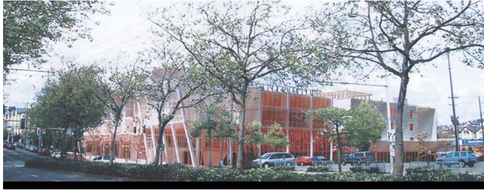
View to the Northeast from 5th Avenue North

Public amenities outlined and revisions made include generous sidewalks on both Fifth and Roy, a more visible rain garden water feature along Roy Street, and chairs made of punched metal that provide public seating on 5 th Ave. These playful, custom made benches will replace benches originally proposed of concrete blocks. Signage and project identity is well thought out with a mix of