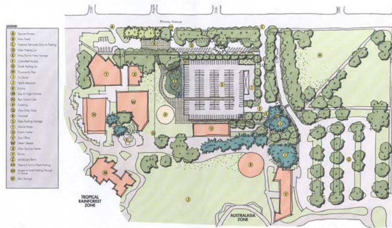
Master Plan Woodland Park Zoo Garage June 1, 2006