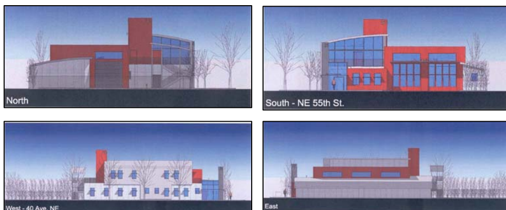
Figure 2: Fire Station 38 Elevations

Each elevation captures a different concept. The south elevation shows a sunscreen, which is a stronger horizontal element. The west side of the building will have more diminutive elements as it approaches single-family units and also because it is across the street from multi-family units. The west detail includes landscape changes from high to low elevations. There is modulation to elevation. Smaller windows will be placed in the thick shell for protection. A rain-screen will envelope the west elevation. The eastern side of the building sits on the property line and the building scale is for future potential wall. It will allow indoor natural light. The north elevation enforces support and function to the yard.