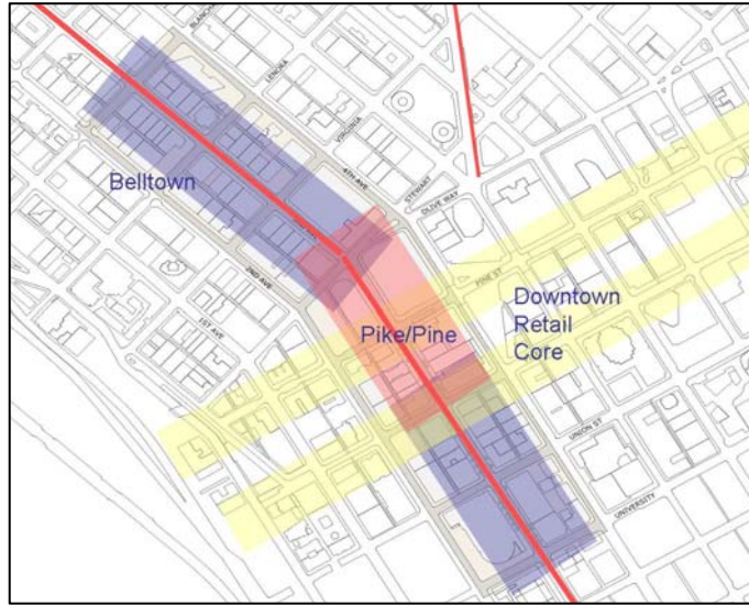
Figure 3: Third Avenue Inventory, Analysis, Recommendations, and Design Concept

landscaping, improving sidewalks, storefronts and building edges, and placing functional and whimsical public art. CityDesign is currently working with private companies to install contiguous glass canopies, such as continuous glass at Century Square. The team is also developing an inviting and coordinated sign program. In regards to the dramatic and abundant landscaping, plantings will include hanging native baskets and 17 large flowerpots. Seattle Parks Department will oversee the irrigation of the landscaping, in addition to local business improvement districts. The sidewalk condition will focus on quality and consistency. There will be compact litterbins that will have six times the original capacity and are capable of alerting maintenance when they sense they are full. More seating will be put in place. There will also be rolled curbs to delineate where cars and pedestrian share sidewalk. There will be improved storefronts and building edges. Macys is working with ZGF to replace the gate with more appropriate scale and design. Public art includes five Nutcracker statues for the holidays, as well as LED lights and planters. The concept plan includes Pike/Pine as the core area, in which sidewalks in front of Macys will be widened by four feet. More trees will be planted and curb cuts will be eliminated.