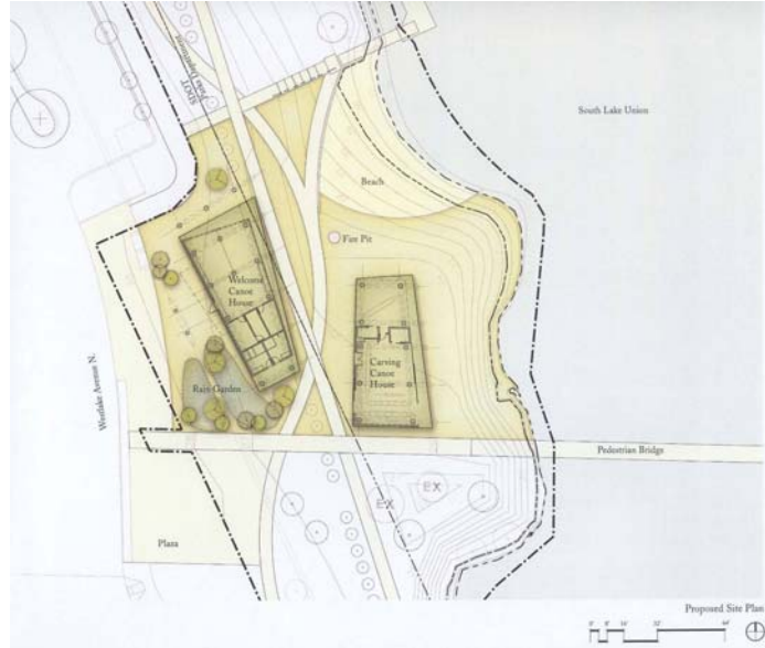
Figure 4: Canoe House Site Plan

alder-smoked salmon bakes, anchor point for Potlatch Trail to Elliott Bay along Broad Street, gift shop with Native American arts and crafts, storytelling, dance and drumming events, and children’s powwows. It is an important consideration that the Welcome Canoe House and Carving Canoe House are located at the soft edge of Lake Union so that the Northwest Native canoe can be launched, displayed, and utilized in an authentic manner.