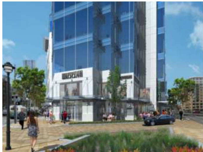
Pavers Extend Into Street