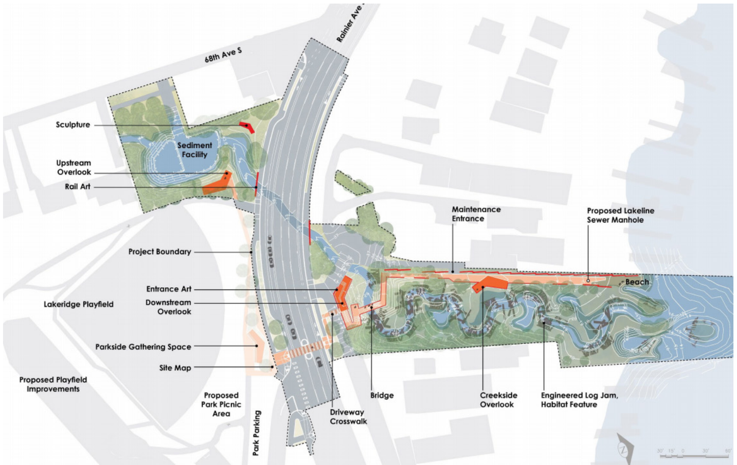
Figure 1: Updated design proposal