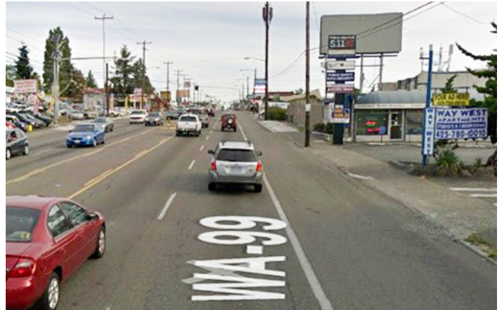
Looking north on Aurora Ave N (SR 99)