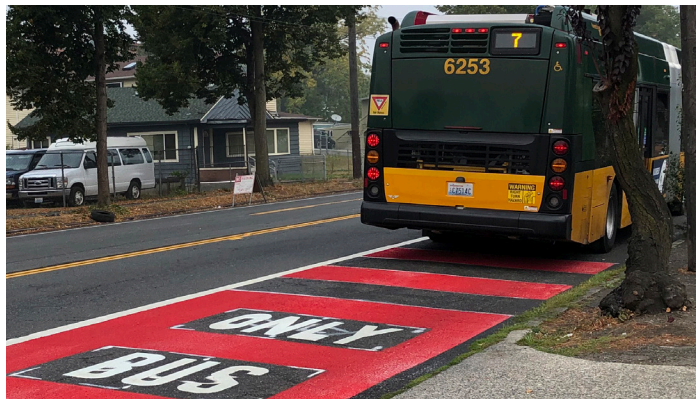
Tusaale jidka baska-kaliya ee cas.

Laamiyada baska-kaliya ayaa ah hal dariiqo oo aan Rainier Ave S uga dhigayno waddo aad u dhamaystiran anagoo ka dhisnayna dhinaca amniga iyo horumarka dhaqdhaqaaq dhismahaas oo qayb ka ah mashruuca Rainier Ave S Vision Zero iyo mashruuca Baska 7 Transit-Plus Multimodal Corridor (TPMC) .