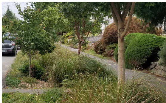
Nidaam biyo-mareen oo dabiici ah oo dhammaystiran oo ku yaal waddo la deggan yahay.